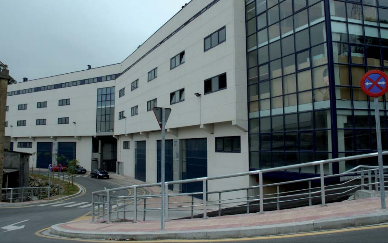
Industrial Estate Barakaldo (Bilbao)