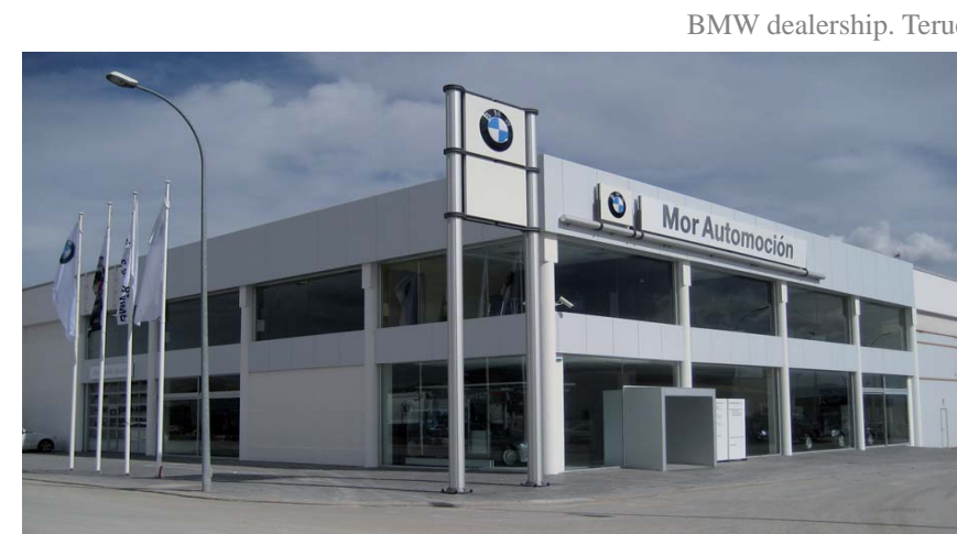
BMW dealership. Teruel