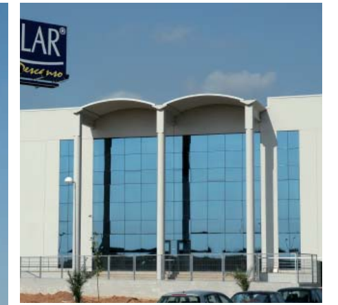
Somilar. Carlet (Valencia)