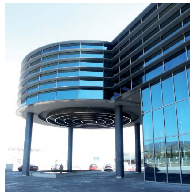
Blumaq. Vall d'Uixo (Castellón)