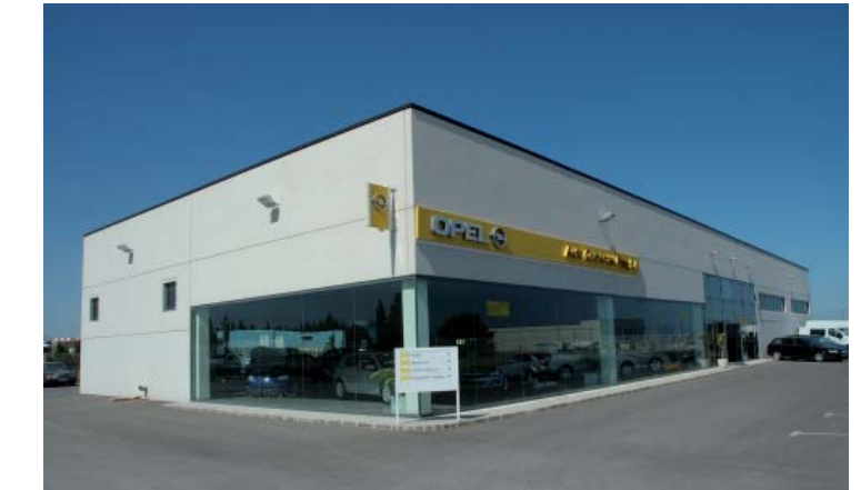
Opel dealership. Tarragona