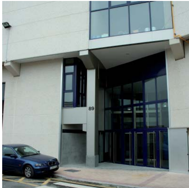
Rotativa Heraldo de Aragón. Villanueva de Gállego (Zaragoza)