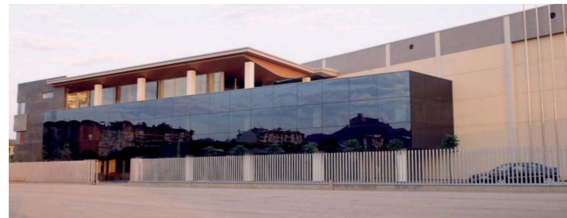
Meflur. Monzón (Huesca)